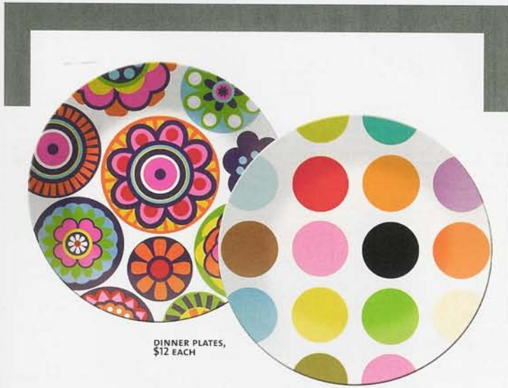
DINNER PLATES, $12 EACH