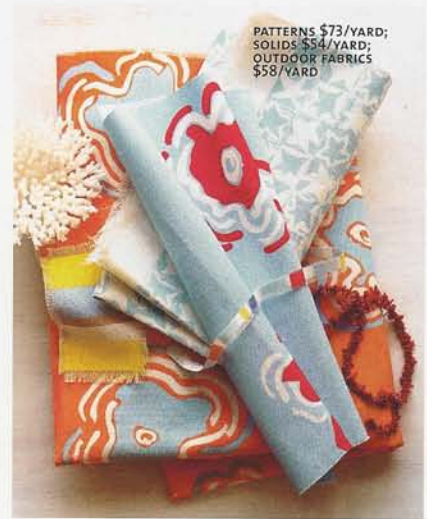
PATTERNS $73/YARD; SOLIDS $54/YARD; OUTDOOR FABRICS $58/YARD

SeaCloth, 107 Greenwich Avenue, Greenwich, 422-6150.